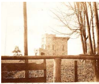
Stone House Centennial Celebration Sat Aug 18